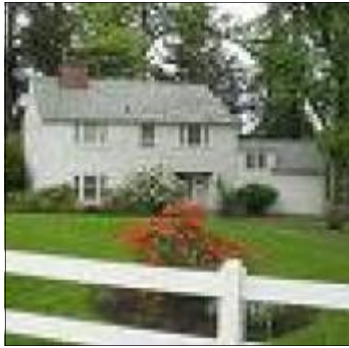
Wayne Morse Historical Park