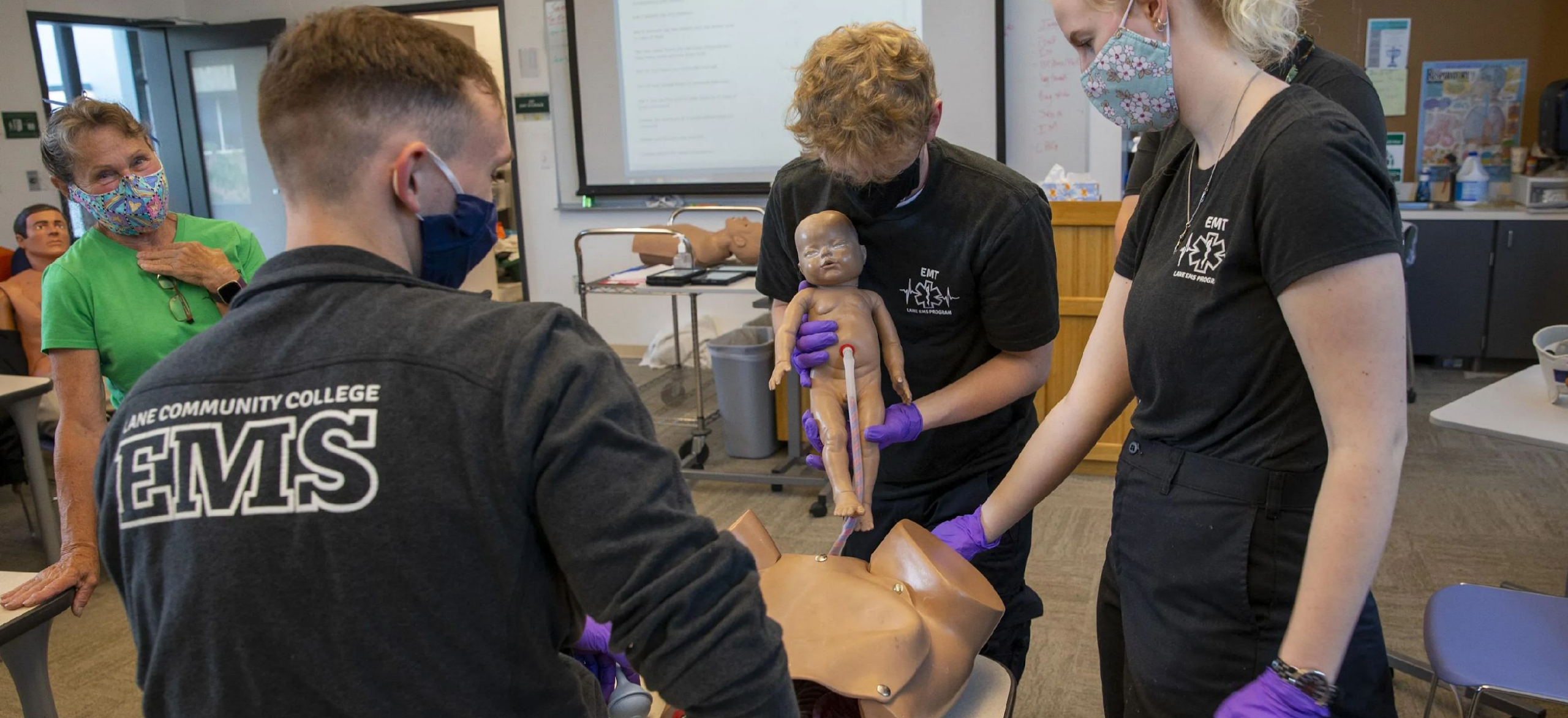
Emergency Medical Technician Program LCC's EMT program is the largest in Oregon.