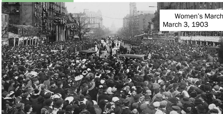
Women's March March 3, 1903