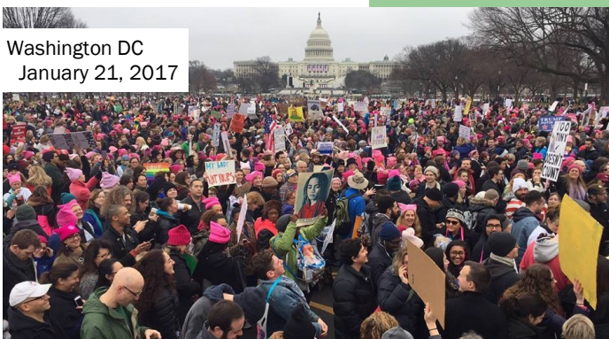
Washington DC January 21, 2017